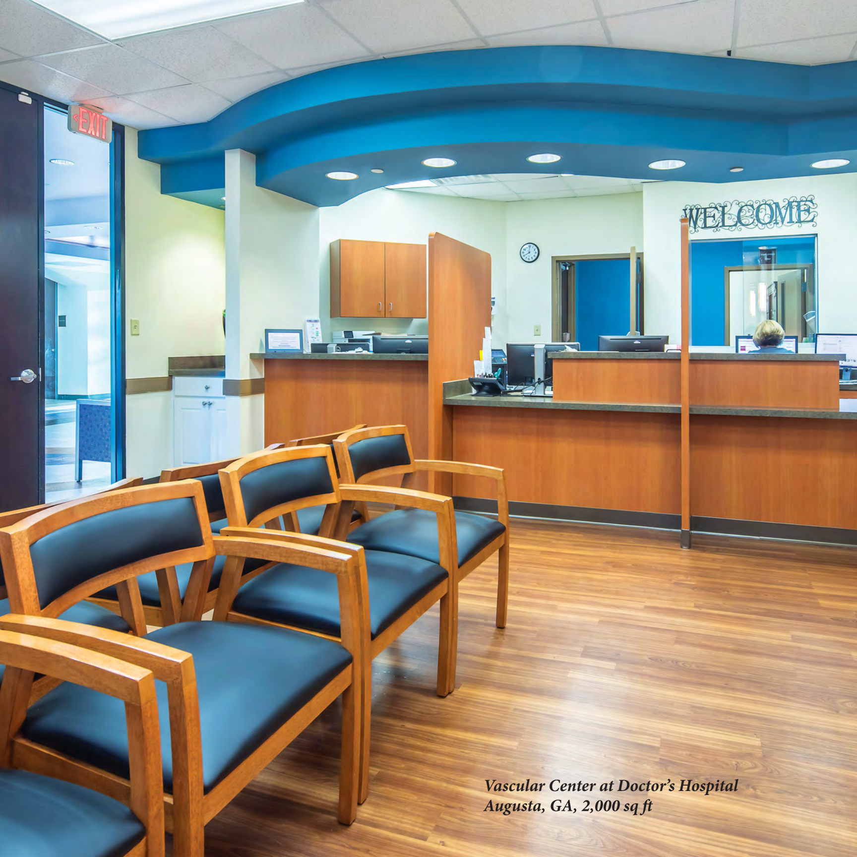
Vascular Center at Doctor's Hospital Augusta, GA, 2,000 sq ft