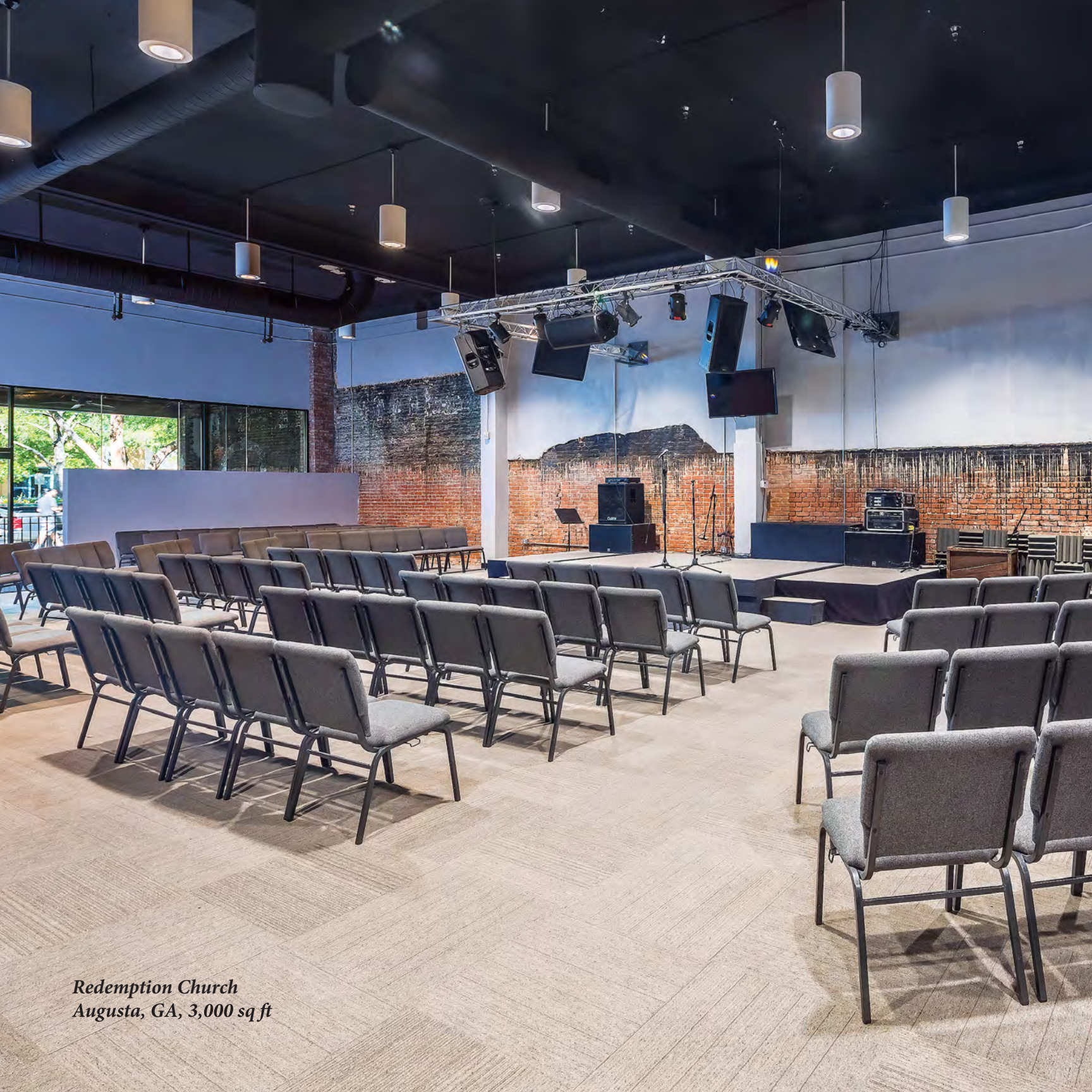
Redemption Church Augusta, GA, 3,000 sq ft