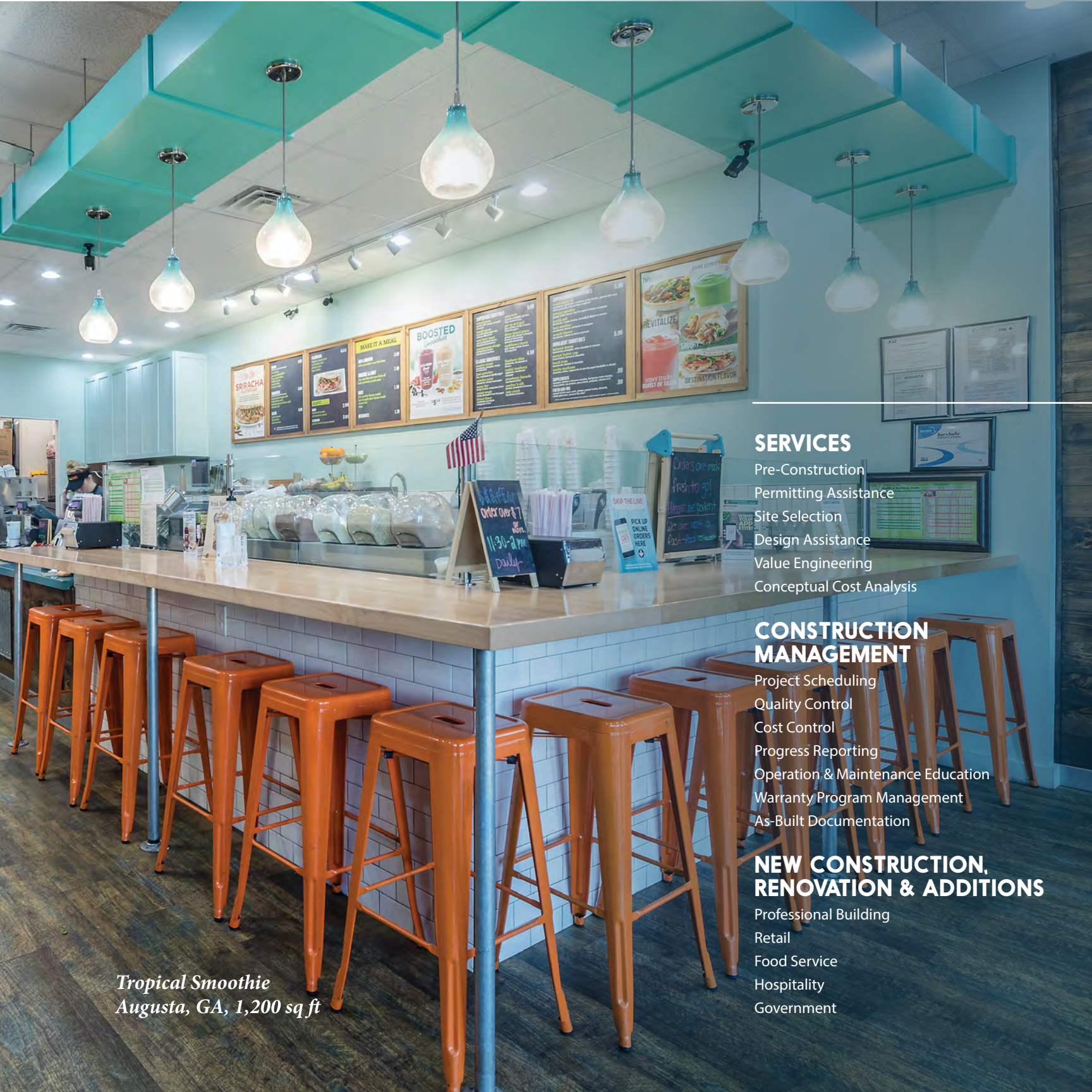
Tropical Smoothie Augusta, GA, 1,200 sq ft